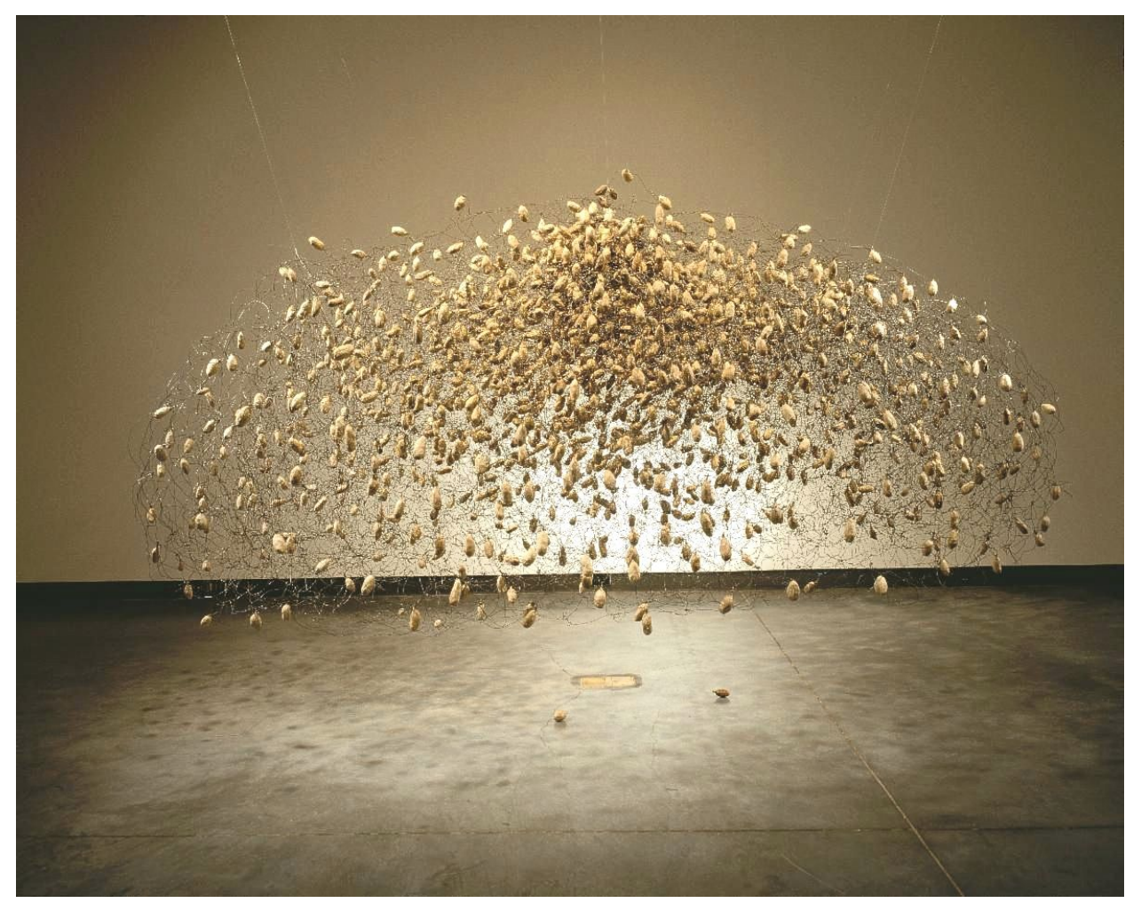
Yuriko Yamaguchi, Web #4, abaca, flax paper pulp and steel wire, 8' x 8' x 1.75', 2003

In The Trees are Humming , Yamaguchi's sculpture invites the viewer in. Web #8 hangs as if it is floating, a suspended explosion that practically buzzes with energy. It is a held breath in a frozen moment, its wire branching and interconnected like roots put on display. And yet, it is just a hint of what is to come once the viewer wanders into Whisper.