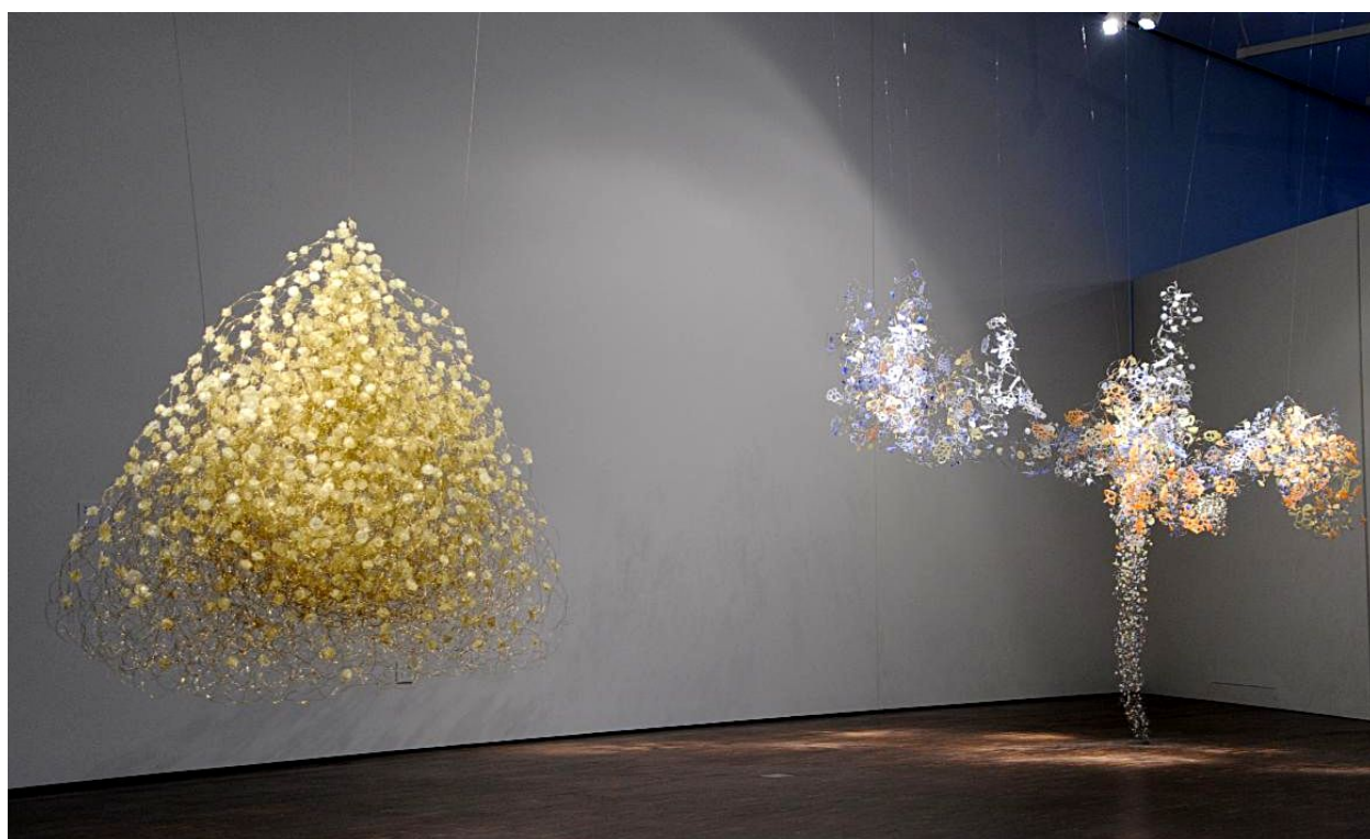
Yuriko Yamaguchi, Web #8, hand-cast resin and stainless steel wire, 8' x 8', 2022