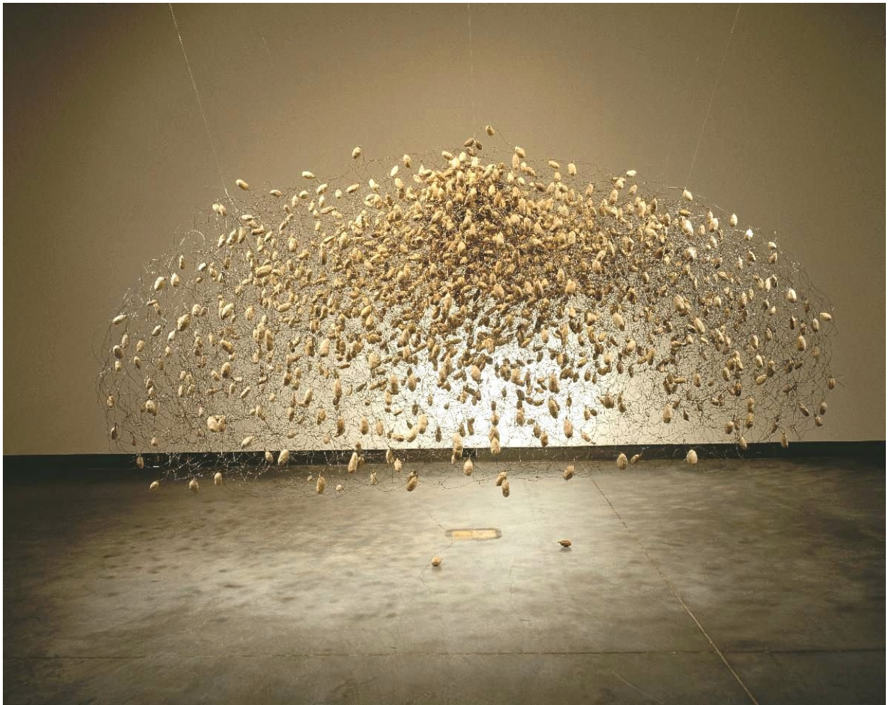
Yuriko Yamaguchi, Web #4, abaca, flax paper pulp and steel wire, 8' x 8' x 1.75', 2003

In The Trees are Humming , Yamaguchi's sculpture invites the viewer in. Web #8 hangs as if it is floating, a suspended explosion that practically buzzes with energy. It is a held breath in a frozen moment, its wire branching and interconnected like roots put on display. And yet, it is just a hint of what is to come once the viewer wanders into Whisper.