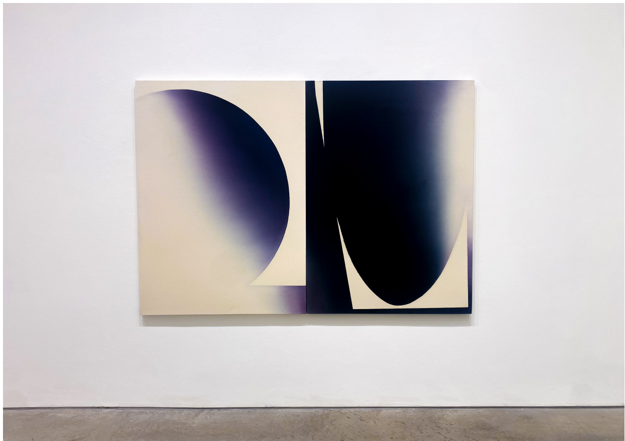
Adam Stępień 245, 251, 2024 Dye on cotton 55 x 79 in (diptych)

William Wood seeks to tap into a private, emotional space—one marked by lush surfaces and layered complexity. Finally, Yuriko Yamaguchi returns us to nature—not as landscape, but as breath, as web, as whispered trace. Her sculptural constellations float in quiet equilibrium, speaking of connection, transparency, and the fragile grace of transformation.