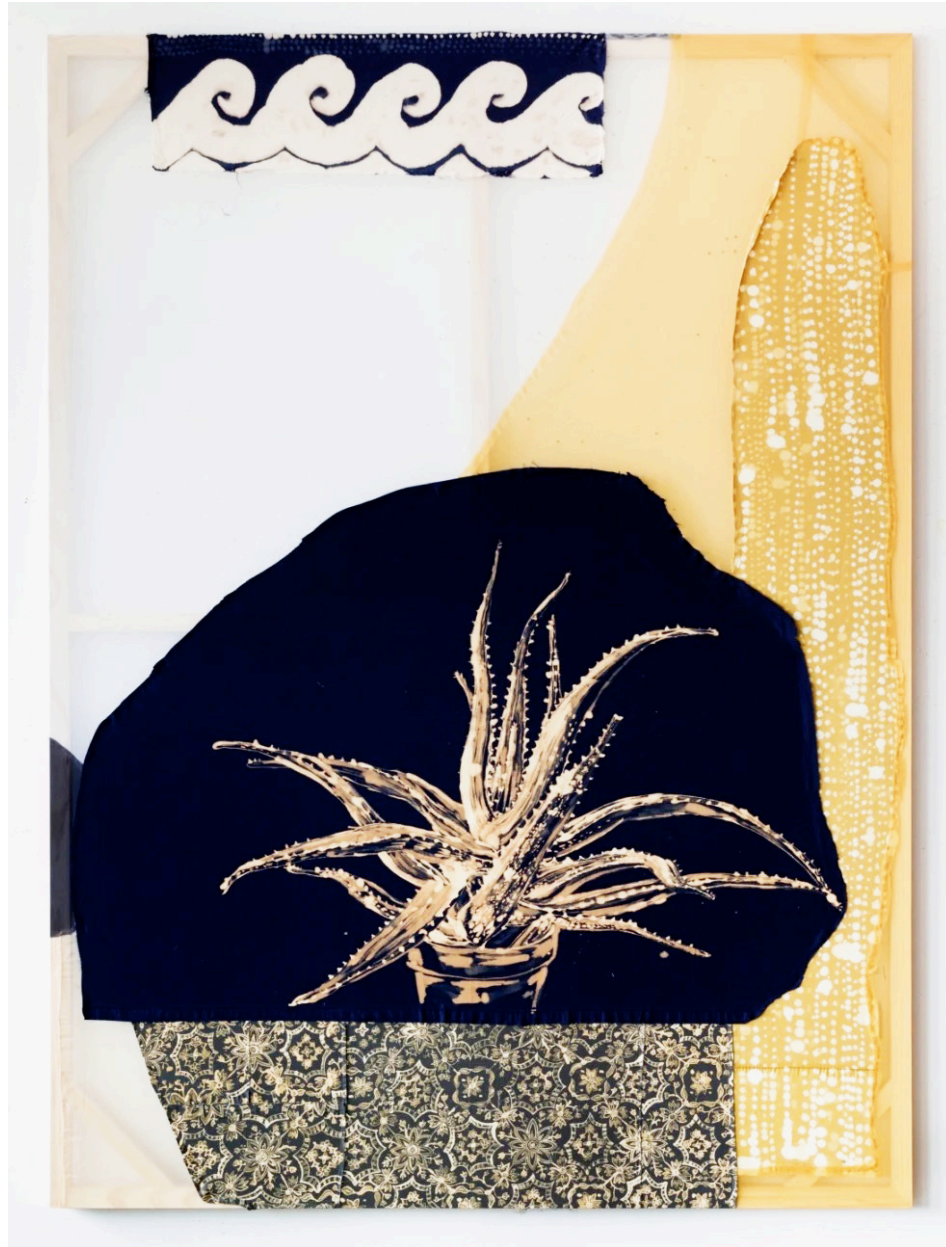
Lauren Luloff Aloe , 2015 Bleached imagery on fabric 91 x 67 in

With Donald Lipski , the embrace becomes paradox: concealment as revelation. His wrapped objects resist easy access, yet whisper of intimacy just beyond reach. Ruth Shouval takes the square—a symbol of order—and loosens its boundaries, letting balance tremble into release, control surrender to motion.